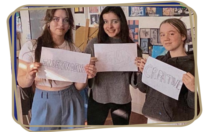
Women of the Year Assembly

"As part of our Inspiring Women's focus work in March, and as a fitting tribute to Surval's 60th anniversary, we have been delighted to welcome Survaliennes, albeit virtually, to talk to the girls as part of an Inspiring Women Guest Speaker Series. They talked passionately about their career and personal pathways and how their Surval experience has had a lasting impact on their life journey. We are very grateful for the ongoing support and loyalty of our Survaliennes network and during my trips to Russia and Mexico this term, it has been a pleasure to meet so many Survaliennes"